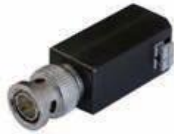
DS-1H18 Video Balun